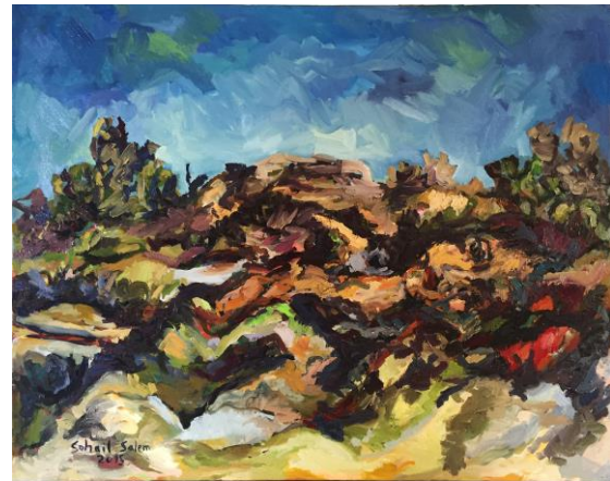
Sohail Salem 2011 oil color on canvas 100cm X 80cm