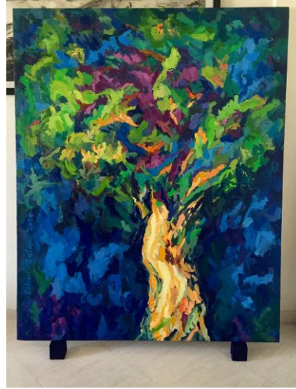
Sohail Salem 2008 X 133 cm Oil color on canvas 2018