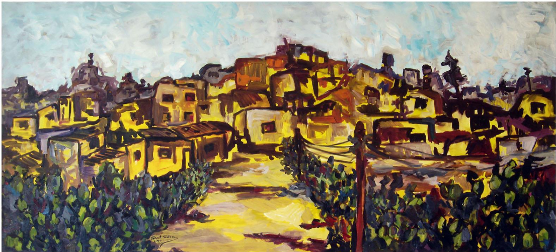
Sohail Salem Paris 2010 Title: The Camp