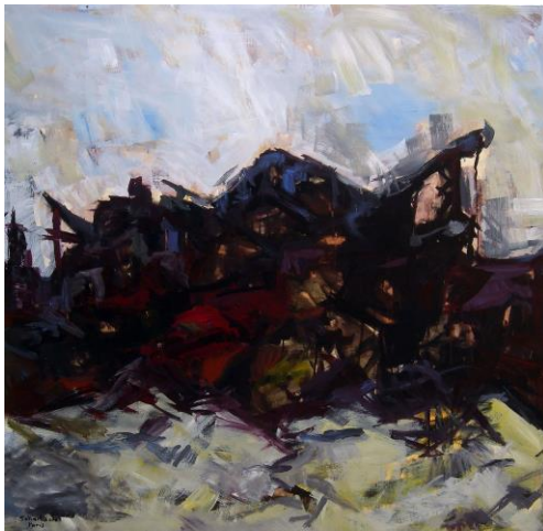
Sohail Salem 2010 Acrylic on canvas 100cm X 100cm