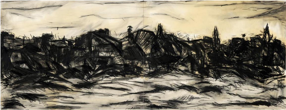
Sohail Salem 2010 Coal on paper 130cm X 50cm