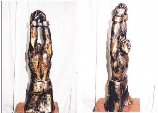
Sohail Salem 1999