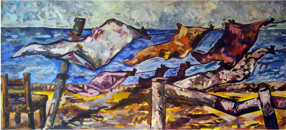
Sohail Salem Paris 2010 Title: Gaza beach