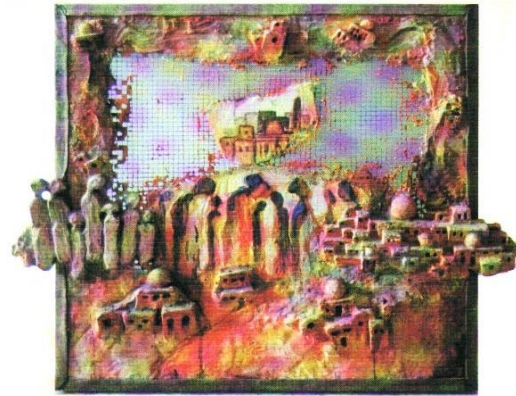
Sohail Salem 2001